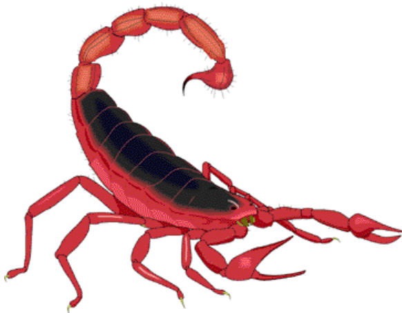
Scorpion Elite Mercenaries LTG: 4652 (5-SCORP)

Rather have the Scorpion for or against you?